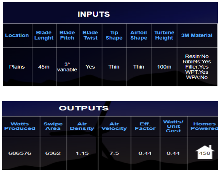
Figure 2: Input and output of wind energy